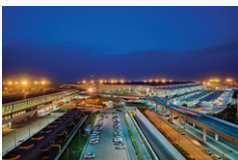
Indira Gandhi International Airport, New Delhi, India

Delhi | Hyderabad | Goa | Philippines | Greece