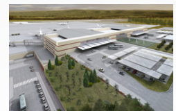
Heraklion International Airport, Crete, Greece