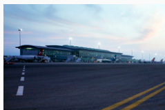
Rajiv Gandhi International Airport, Hyderabad, India