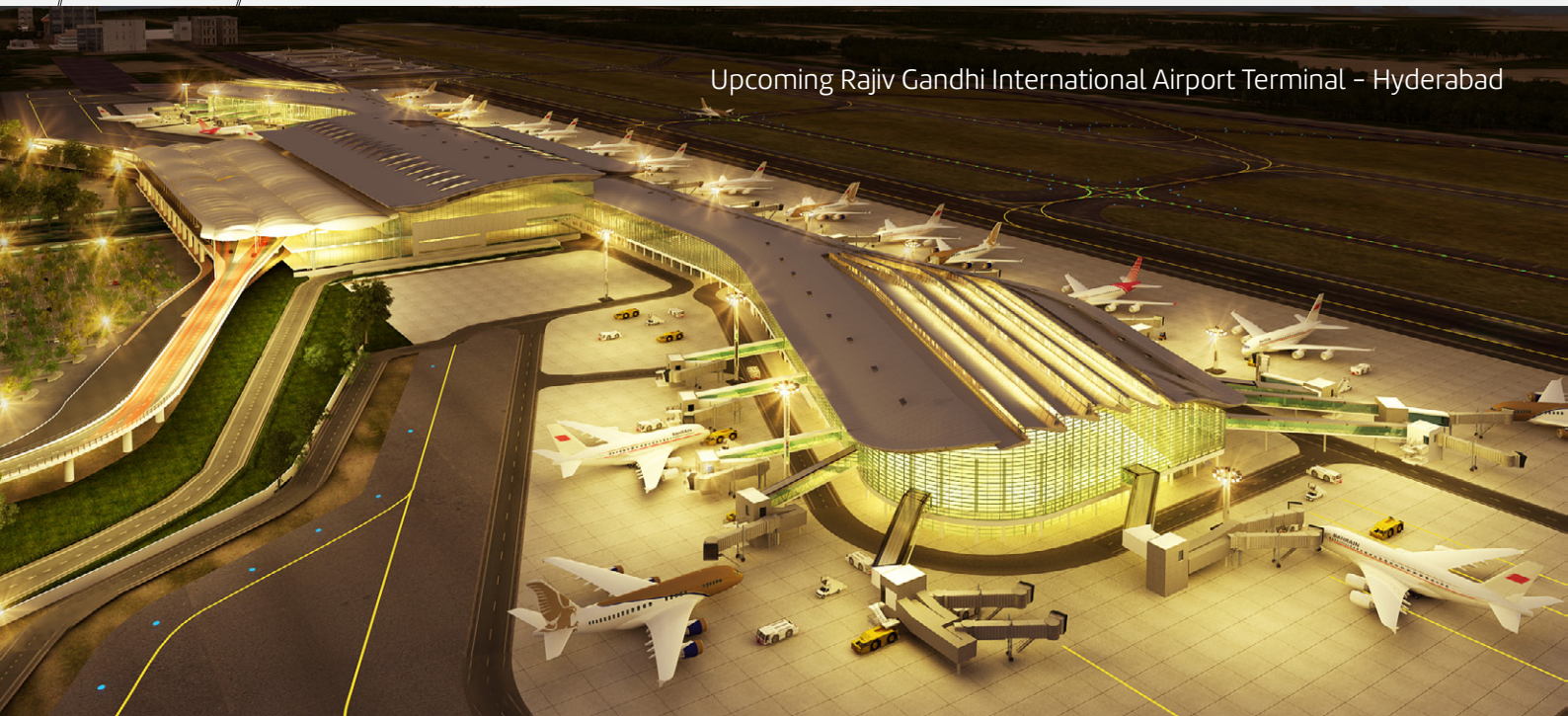
Upcoming Rajiv Gandhi International Airport Terminal - Hyderabad