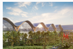
Mactan Cebu International Airport, Cebu, Philippines