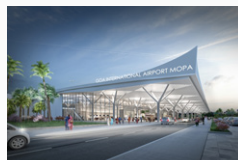
Goa International Airport, Mopa, Goa